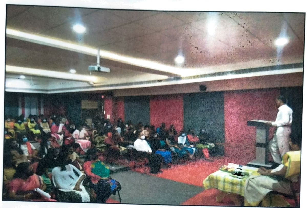
Awareness programme on Food Adulteration