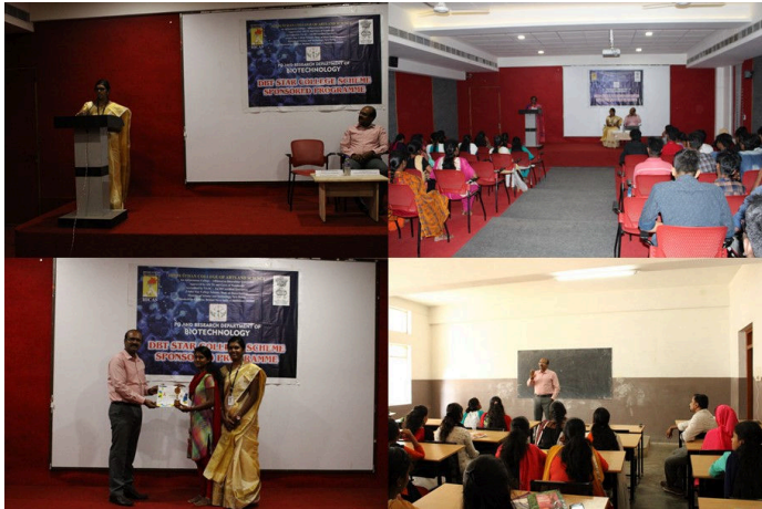
Glimpses from the Prize Distribution ceremony

An interdepartmental essay and poem writing competition in Tamil and English languages on “AIDS Awareness” was conducted by PG & Research department of Biotechnology on world AIDS day, December 1 st 2019.