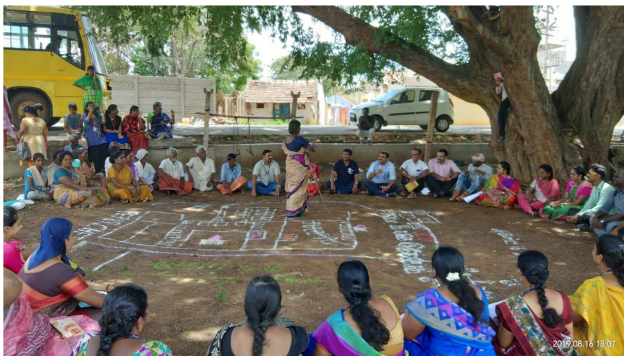
Rural Immersion and Community Engagement in Improving Rural Education at Perur Chettipalayam