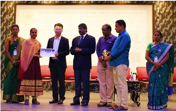
The chief guest with the principal in the photo inset