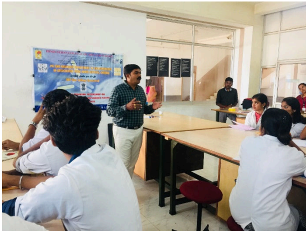
II UG students attending workshop on “Immunological Techniques-Complement Fixation Test”

they experienced a hands-on session on Complement fixation test which will be helpful for them in the future.