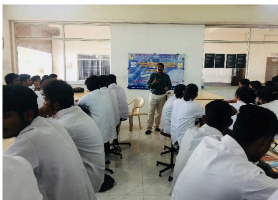
I UG Students attending work shop on “Chromatographic Techniques” at UG lab.

A one-day in house workshop was conducted on the topic “ Chromatographic Techniques ” on 26 st February by Abbes Biotech, Private LTD, Chennai , for I UG students of PG & Research Department of Biotechnology. It was very helpful for the students to understand the procedures of Chromatography through the hands-on session, which will be helpful for them in the coming years.