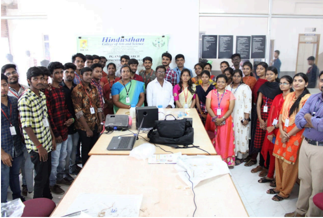
Chief Guest and Organizing Team in the portrait with respective lecture and hands-on session