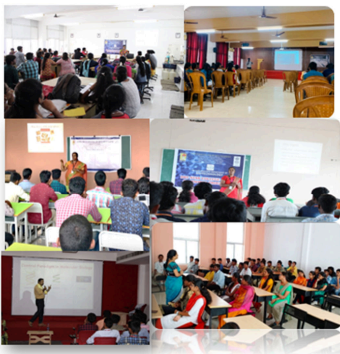
The faculty members of PG and Research Department of Biotechnology charged on DBT One-week Lecture series

An interdepartmental DBT STAR College scheme lecture series was convened as a one-week Programme from 23.09.2019 to 27.09.2019. The following lecture series has been organized by The Department