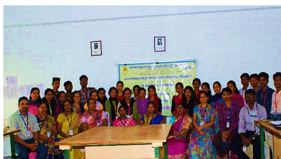
The chief guest and organizing committee posing at the time of certificate distribution