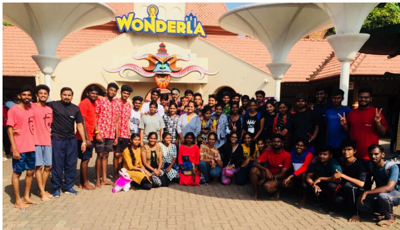
III BSc Biotechnology students enthralled to visit Environmentally significant place