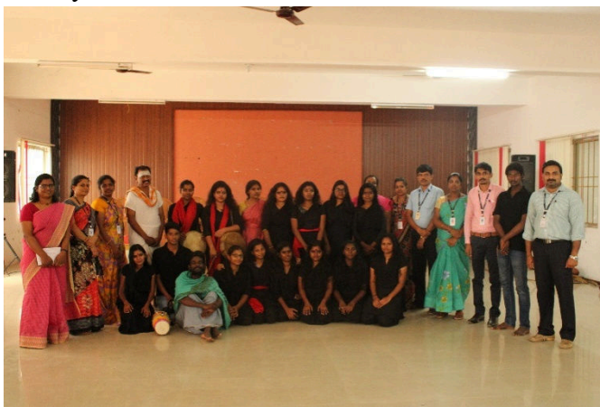
Drama artists portraying alongside the organizing team