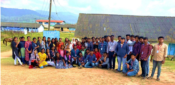
II BSc students at Central Sheep & Wool Research Institute