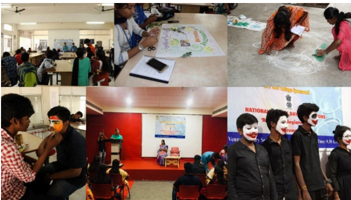
Participants from various colleges competing for various events during National Science Day Celebrations and Chief guest Lecture about “Women in Science”.