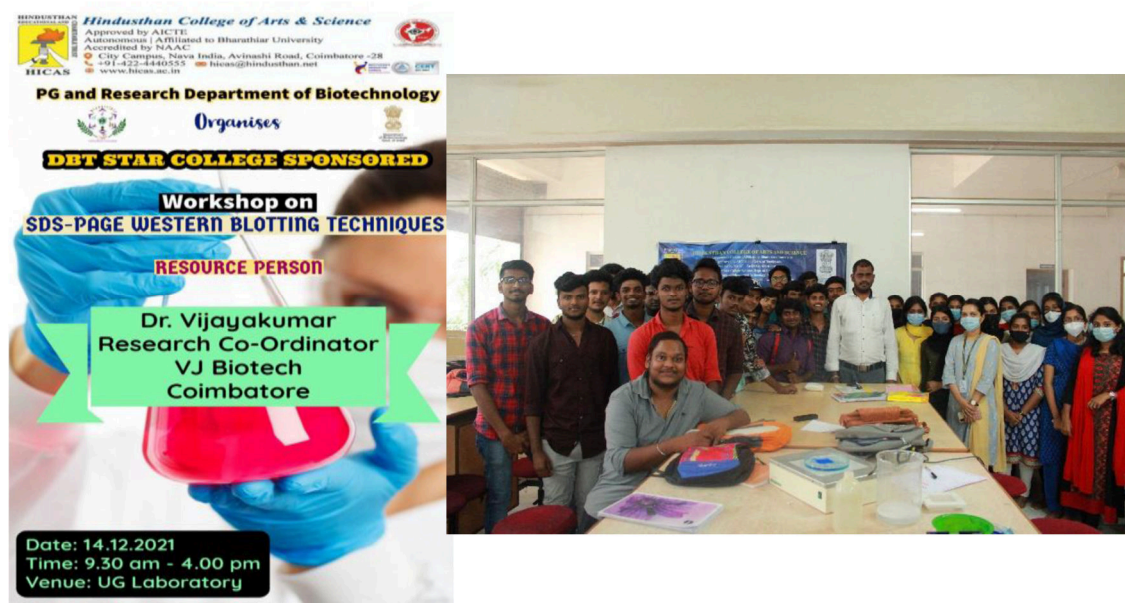
Glimpse and brochure of the event