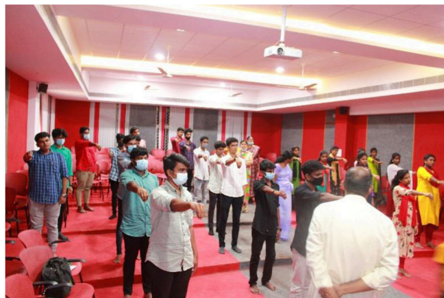
Glimpse and brochure of the event