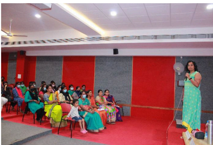
Glimpse and brochure of the event