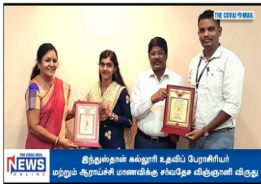
BEST RESEARCHER AWARD-2021